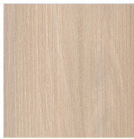
ASH C16 Warm white oiled

We treated this wood with our 'Mocca brown oil'.