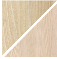
ASH C6 / OAK C6 White oiled

We treated this wood with our 'Natural oil'.