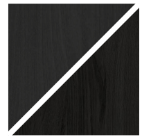
ASH C44 / OAK C44 Black matt lacquered

We treated this wood with our 'Grey brown oil'.