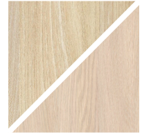
ASH C8 / OAK C8 Soaped

We treated this wood with our 'White oil'.