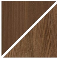
ASH C12 / OAK C12 Antique brown oiled

We treated this wood with our 'Dark grey oil'.