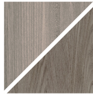
ASH C13 / OAK C13 Light grey oiled

We treated this wood with our 'Antique brown oil'.