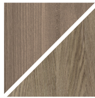
ASH C20 / OAK C20 Grey brown oiled

We treated this wood with our 'Grey brown oil'.