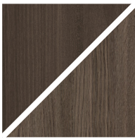
ASH C15 / OAK C15 Mocca brown oiled

C14 is for legs and storage furniture only!