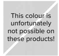
ASH C14 / OAK C14 Black stained & oiled

We treated this wood with our 'Light grey oil'.