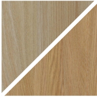
ASH C3 / OAK C3 Lacquered