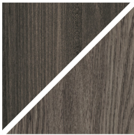
ASH C11 / OAK C11 Dark grey oiled

We treated this wood with our 'Dark grey oil'.